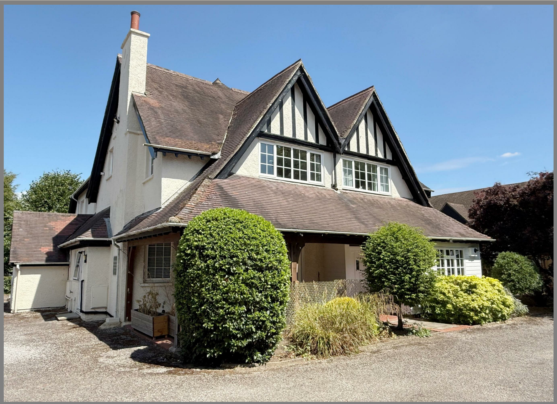
Ilchester Court, Link Road, Newbury, RG14 7LN